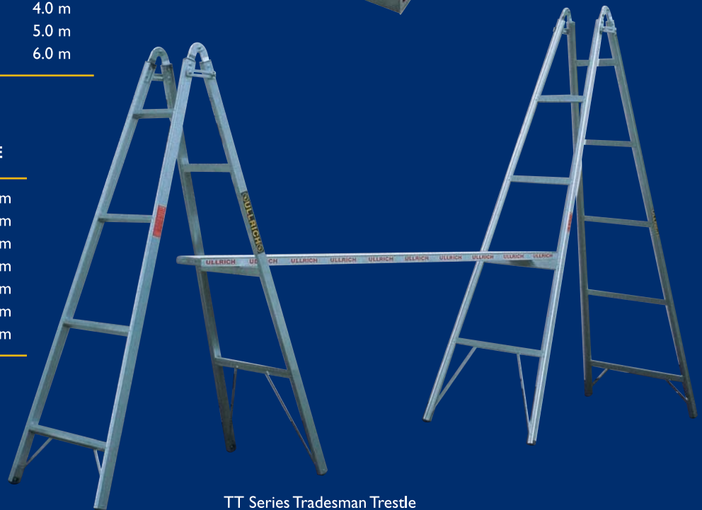
TT Series Tradesman Trestle